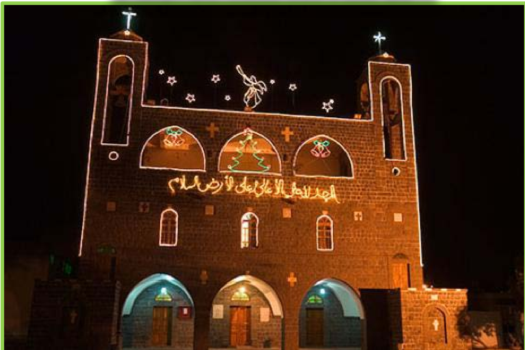
St. George's Syrian Orthodox Church in Zaidal, Syria