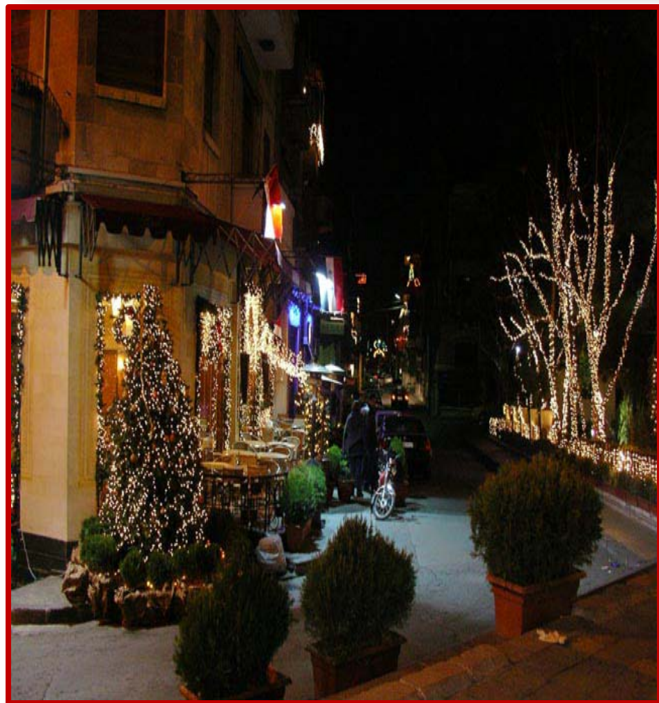
Holiday lights in Syria